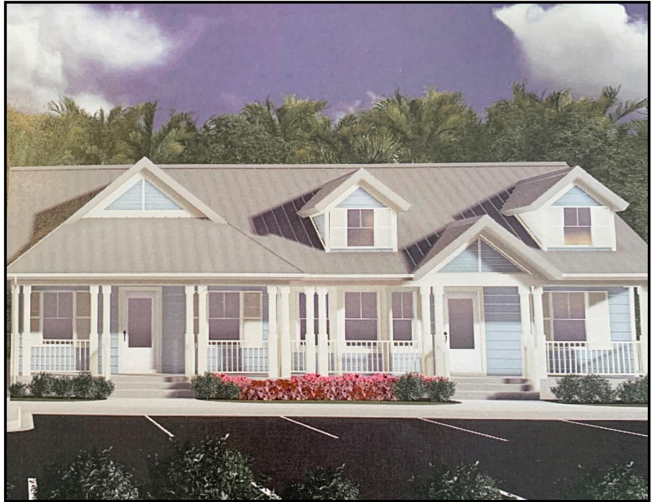
Future Construction - Four Duplex Cottages

Four duplex cottages, adjacent to the New Life Chapel, have been approved by the Village of Tequesta and will provide a transitional home for each mom and baby. After they complete the two year program in Hannah's Home, moms and babies will progress to a six month program where they live on their own in a duplex and become better prepared for independent living.