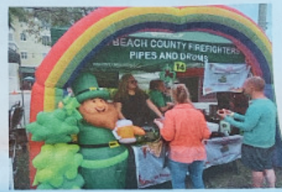
Tequesta Profile on page 3